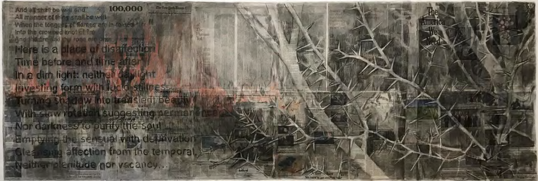
52 x 144 inches print media collage, charcoal, pastel / paper 2020