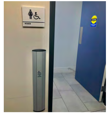
Accessibility push bar for operating restroom door on the second floor of One Main Building on Sept. 11, 2022.

Third, she said that accessibility comes from