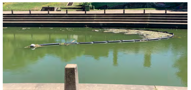
A trash collector gathering garbage as it moves down the bayou.