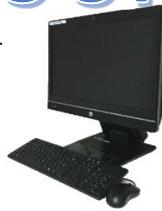
HP All-in-One $150 + tax