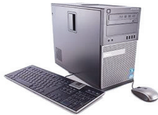
Dell Optiplex mini tower (no monitor) $125 + tax