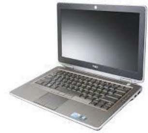
Dell & HP Laptops $175 + tax

Quality used computers available for sale to currently registered students.