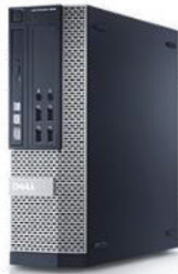
Dell Optiplex Small Form Factor (no monitor) $125 + tax